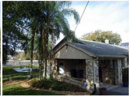
East - carport entrance and south carport area