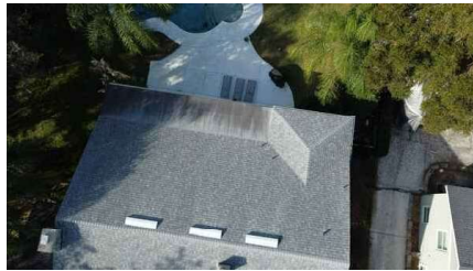
Drone back with flat roof