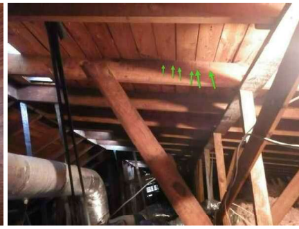
1 to 2 8d nails in planks

Inspectors Initials DR Property Address 1316 Mayfair Rd, Jacksonville, FL 32207