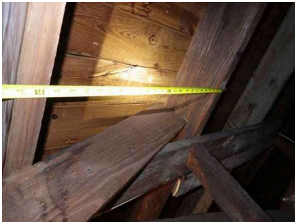
Trusses 24" centers