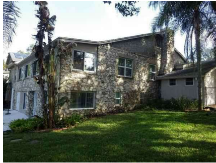
South and test roof lines