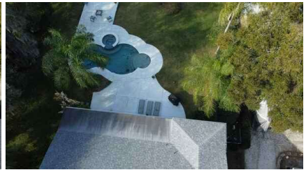
Drone back with pool