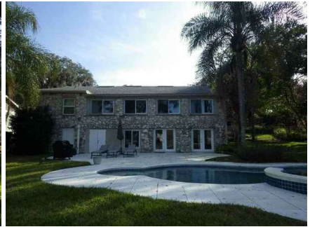
South with pool