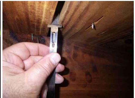
Planks 20mm or 3/4 inch

Inspectors Initials DR Property Address 1316 Mayfair Rd, Jacksonville, FL 32207